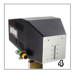
3) The 750ml no-mess can ink system provides the uptime you need in your operation.